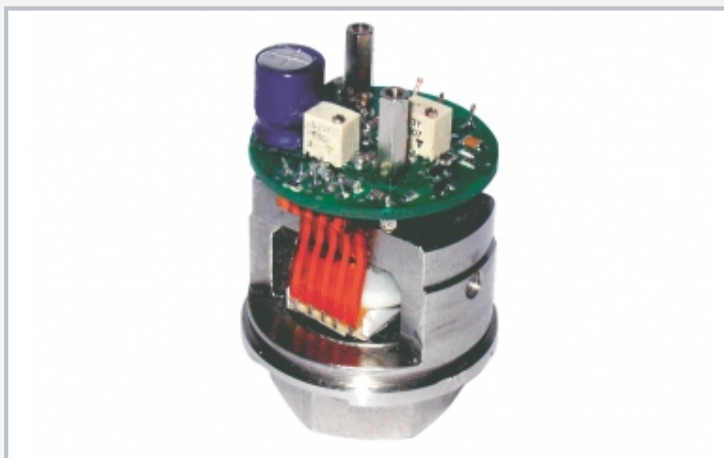
Interior layout of an electronic pressure sensor